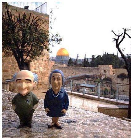
The Jewish Quarter, Jerusalem